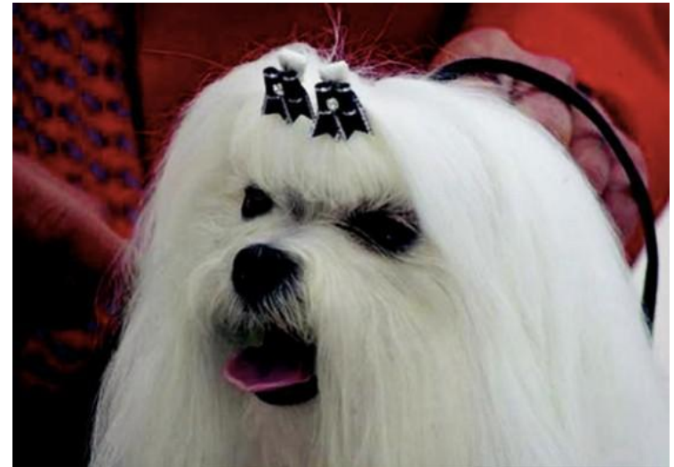
The eyes could be more rounded

Eyes: subfrontal (but almost frontal), rounded, only slightly protruding, dark ochre. Nowadays we can see too prominent eyes and in perfect front position, in this case the Maltese has too short muzzle