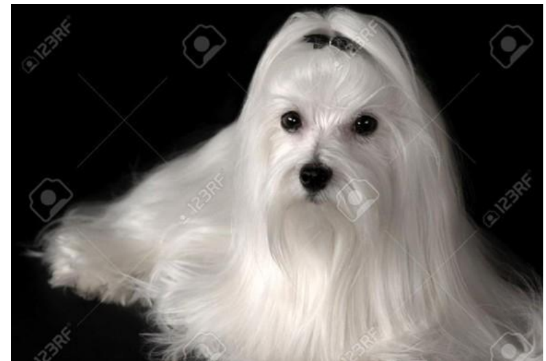
Muso troppo lungo

Lips: Viewed from the front, the upper lips at their junction have the shape of a very open arch.