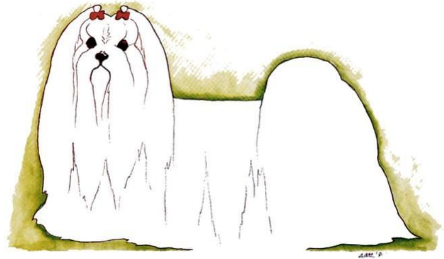
Short on legs and Too long in body

BEHAVIOUR/TEMPERAMENT: Lively, affectionate, very calm and very intelligent.