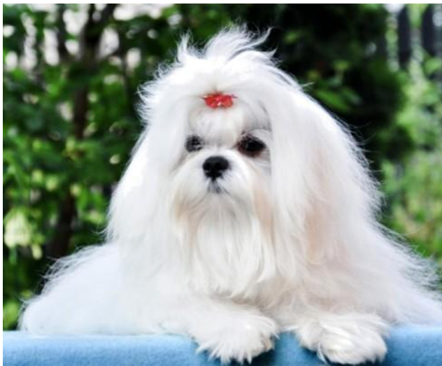
Muso troppo corto

Muzzle: Length of muzzle is slightly less than half the length of the head. The suborbital region is well chiselled. The depth is much less than the length. The sides of the muzzle are parallel, but the muzzle seen from the front, must not appear square, since its anterior joins the lateral sides by curves. The muzzle is rectilinear with a well-marked furrow in its centre part.