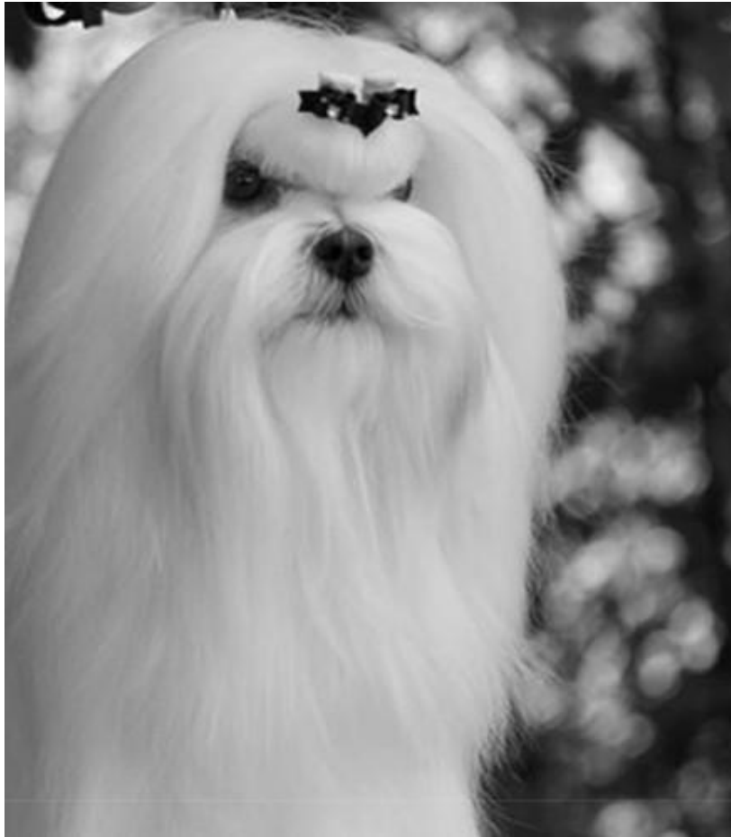
Correct proportion Skull-Muzzle

Proportion between muzzle–skull is very important for the breed. Nowadays there is the tendency to breed Maltese with too short or in few cases too long muzzles and this is changing a lot their typical expression.