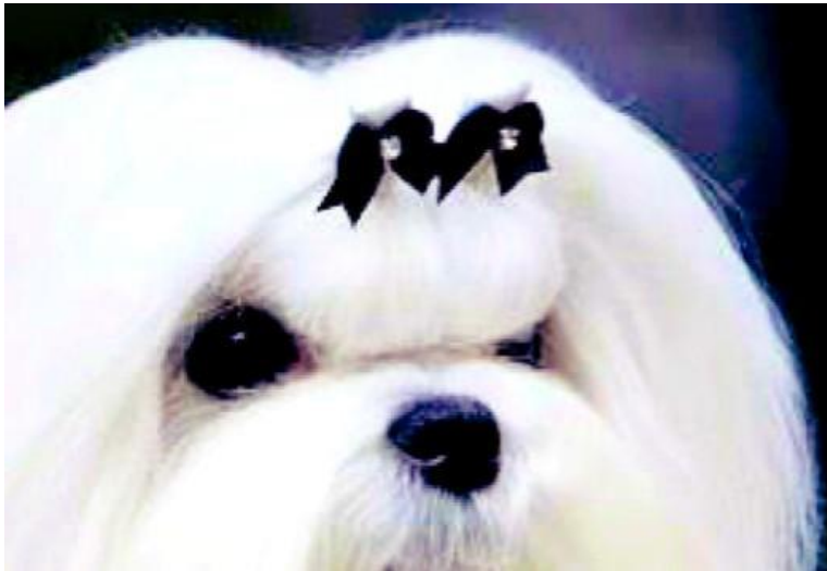
An Excellent Eye

Open, with lively and attentive expression, larger than would be expected; the shape tends to be round. The position and the colour of the eyes is very important for keeping the right expression of the breed. The eyes should be never black and should never show the white . A black eye is giving an arrogant expression to the breed which is not the right one. This is a fault to penalize.