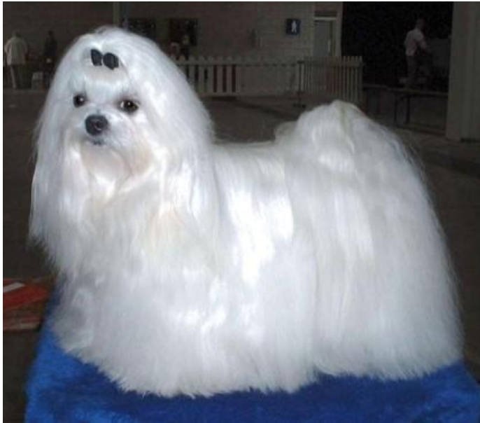
Too high on legs and too short in body