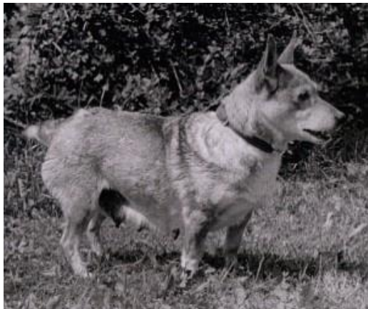
The first brood bitch "Vivi", born around 1935