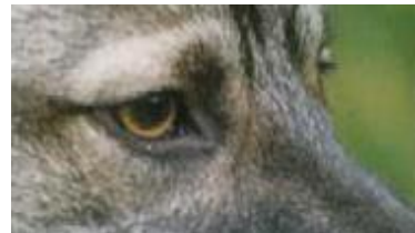
Too light eyes (wolf-like)