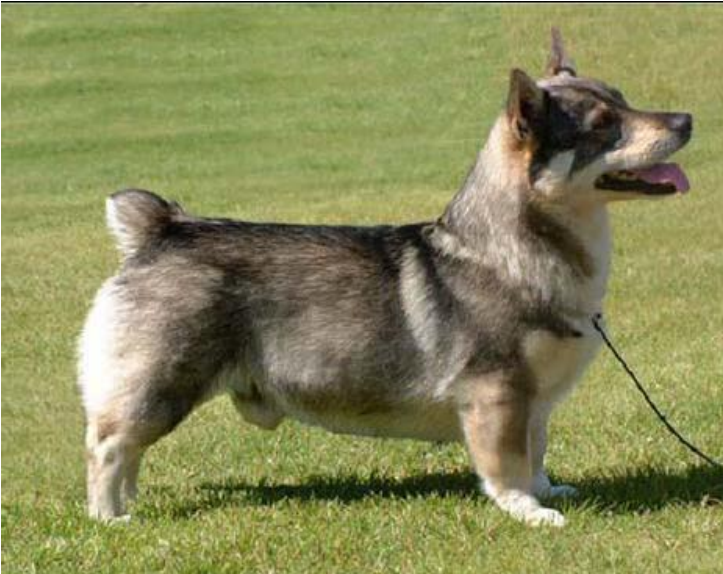
Male of excellent type