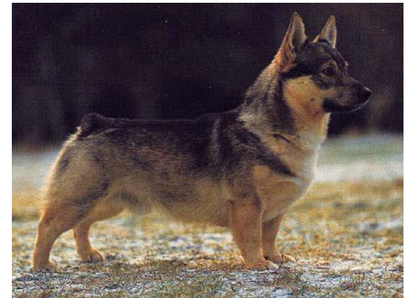
A male from the 1970's (who could still win today)