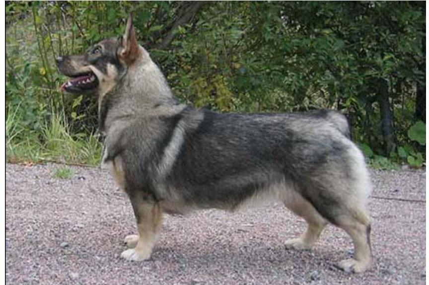
Female of excellent type