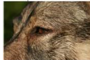
Obliquely placed eyes give a hard expression