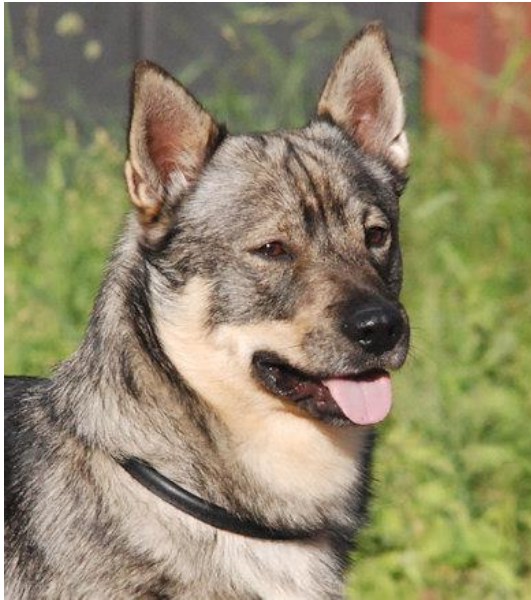
An excellent male head. Could have slightly less wrinkles.