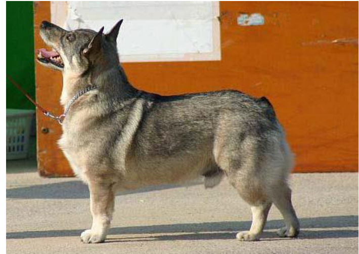
Grey male, a bit short in back and too round and steep in croup.