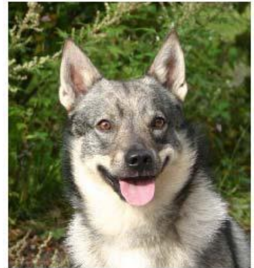
Light and round eyes gives the wrong expression

Be aware of eyes too round and protruding or eyes obliquely placed or placed too narrow, which will spoil the expression.