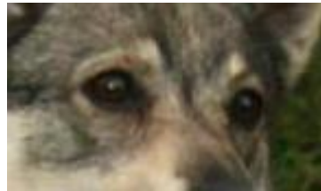
Too round eyes