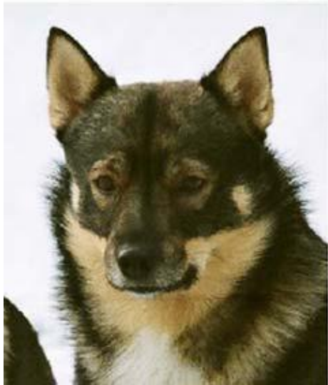
Excellent eyes and expression

Eyes should be of medium size, oval in shape and dark brown.