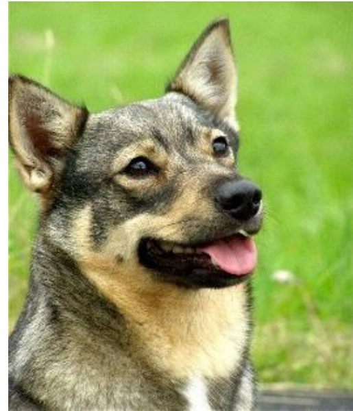
Excellent female head