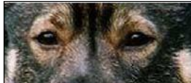
Excellent shape and colour