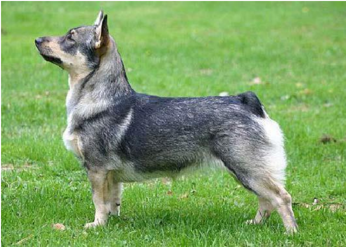
Grey female with an excellent back.