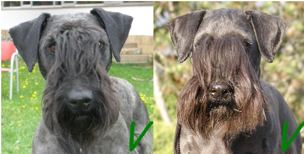
Correct ears (almost fully ) closed to the cheeks.