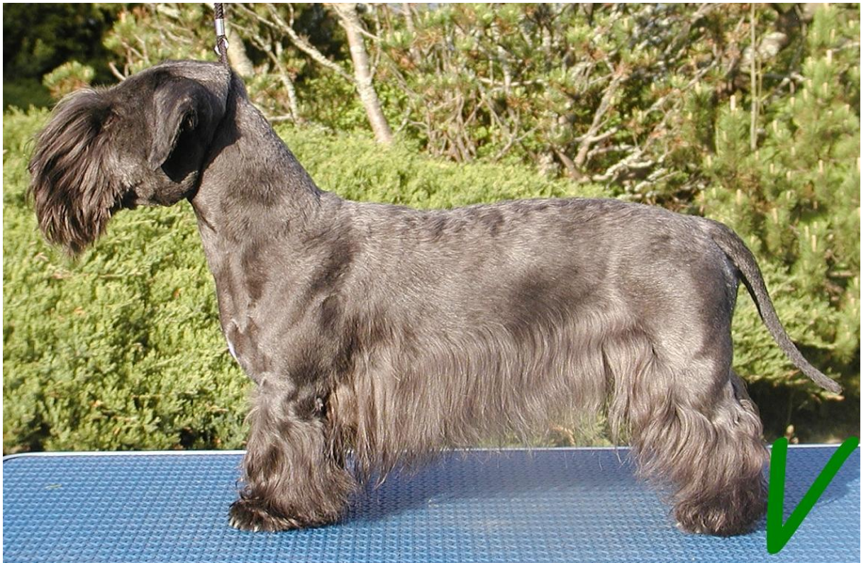
Correct topline in a male.