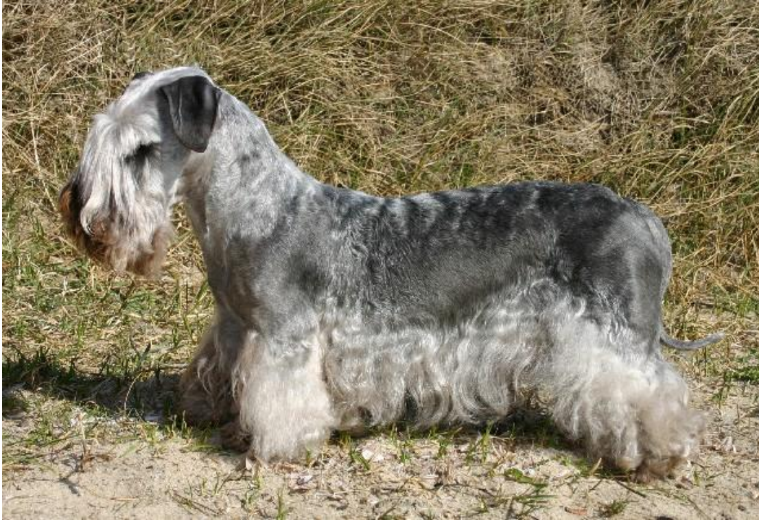
Excellent medium grey colour with light grey furnishings (this is not a white colour as the skin is fully pigmented!) and typical dark, almost black ears. Note the typical topline in this 11-years old female.