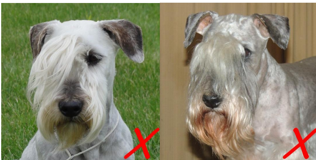
Not correct ears (left: wrong folded; right: too light+ open)