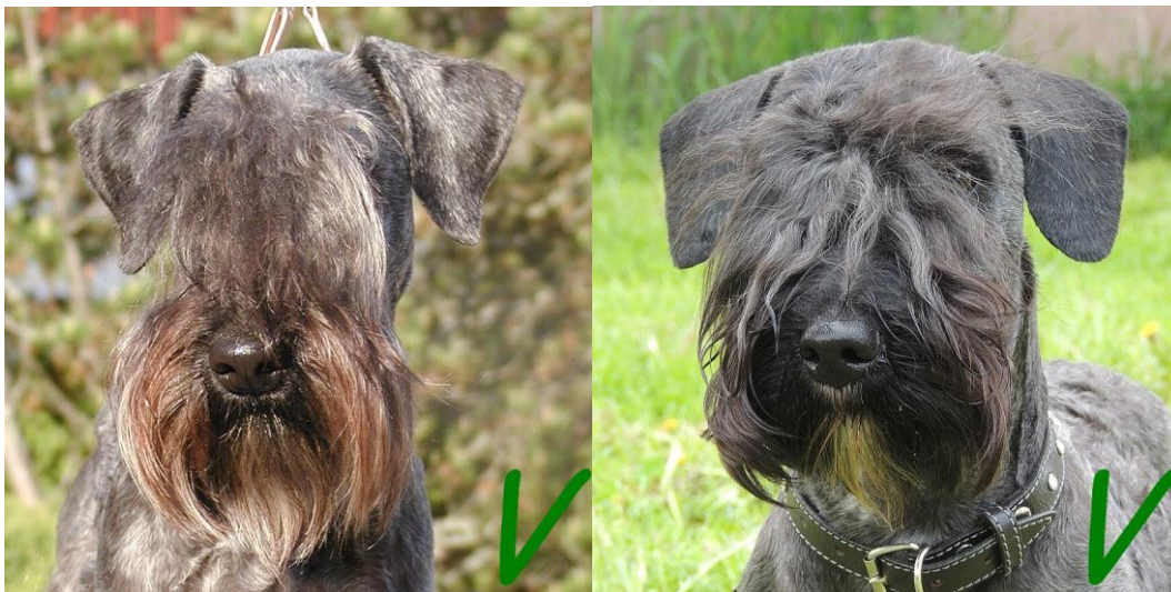
Acceptable ears (left: diverted point, right: lower set+slightly rounded point)