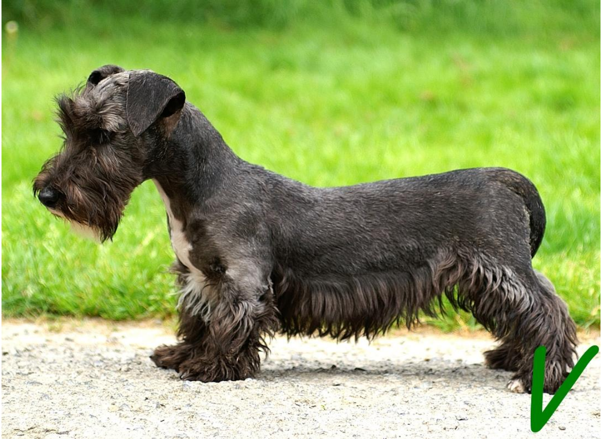
Acceptable topline in a 4 months old puppy. The development is not finished yet.