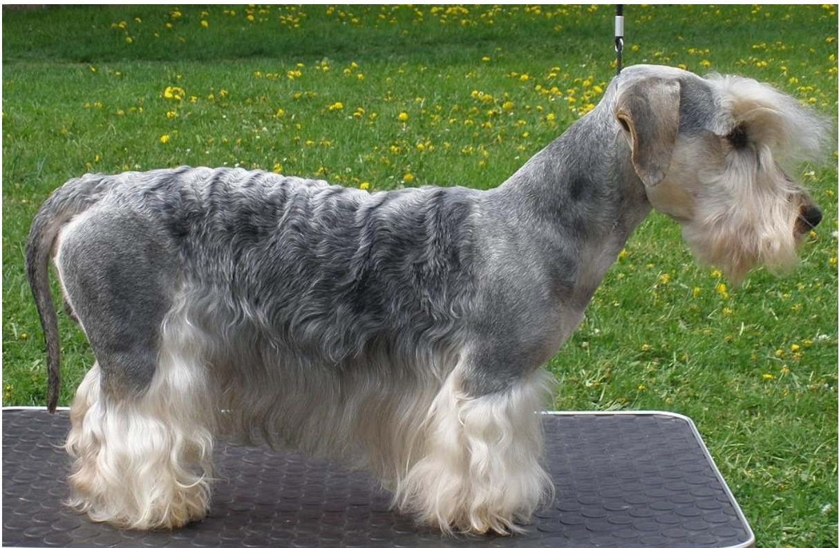
Correct blue&cream colour. Also this high quality male has no white hair.