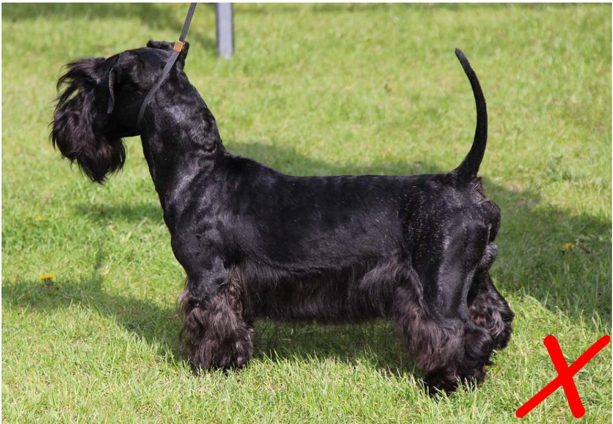
Not correct, too flat topline with a short croupe and a (not correct) high tailset.