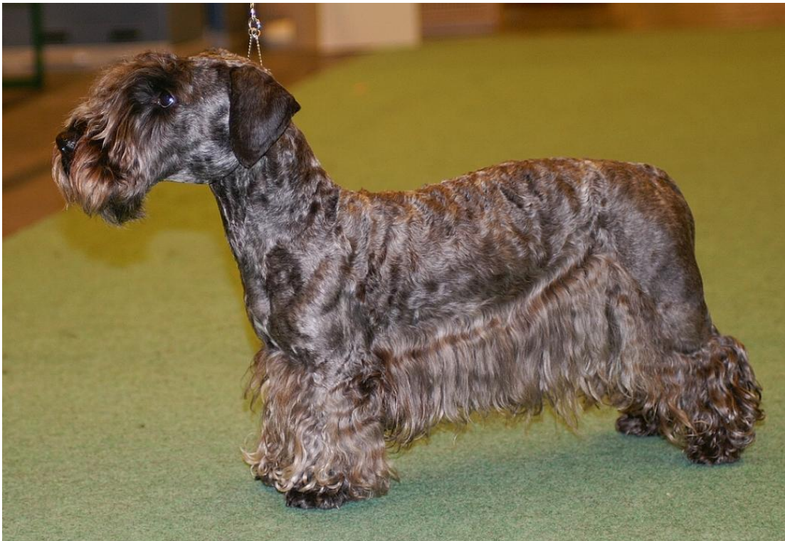
Brindle coat, acceptable in a young Cesky Terrier, mostly not visible in an adult dog any more. Please, pay attention to this colour as the genetic basis is incorrcet brindle colour.