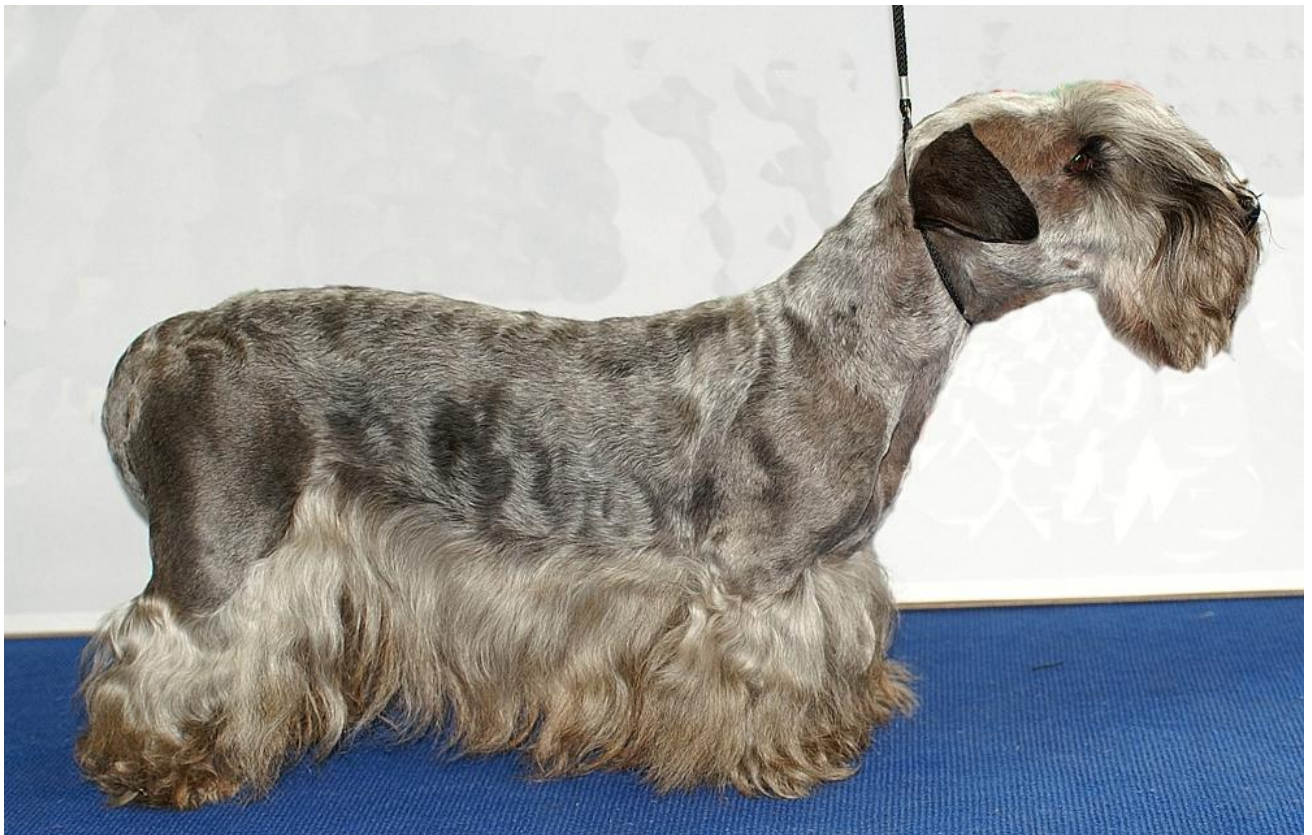
An excellent adult female, showing correct body construction and topline.

The arch over de loins develops with the age, so do not penalize the youngest puppies for rather flat topline. The arch is often more explicit in the females.