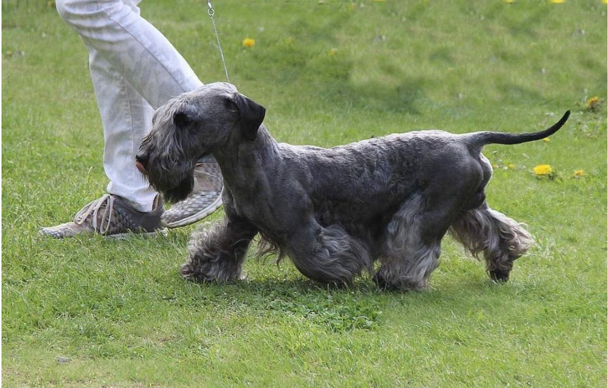
Correct tailset and tailcarriage at movement.