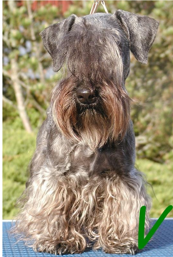
Correct fronts: not too wide (not more than one handpalm) and as straight as possible. Feet pointing forwards.