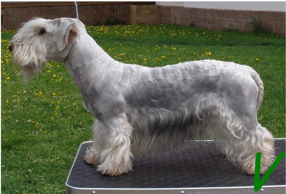
Correct topline in a female. Note also the correct blue & cream colour.