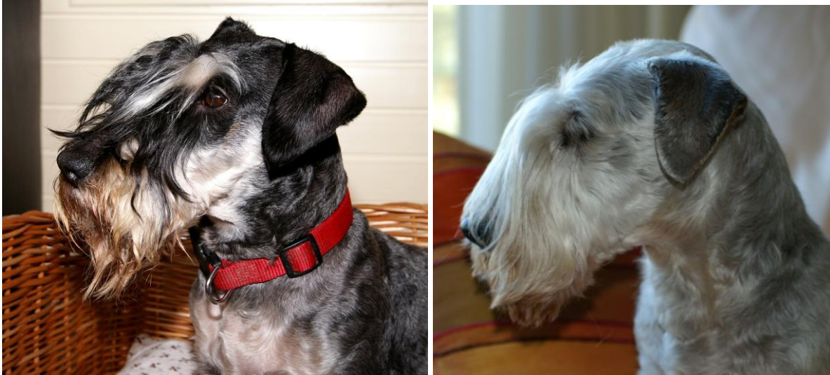
Two litter-sisters, both born as a black&tan, the left one in dark-grey shade, the right one pale. Both these Cesky Terriers are of correct colour and have no one white hair!