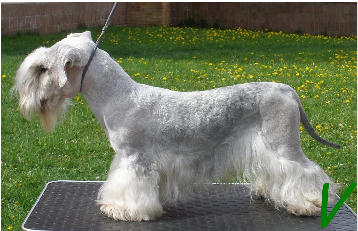
Acceptable topline in an adult male. The arch over the loins could be more pronounced.