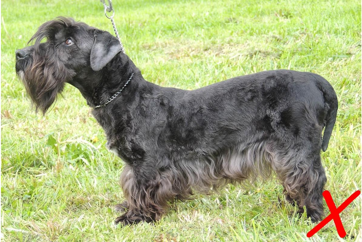
Not correct, rising topline, caused by steep rear angulation.