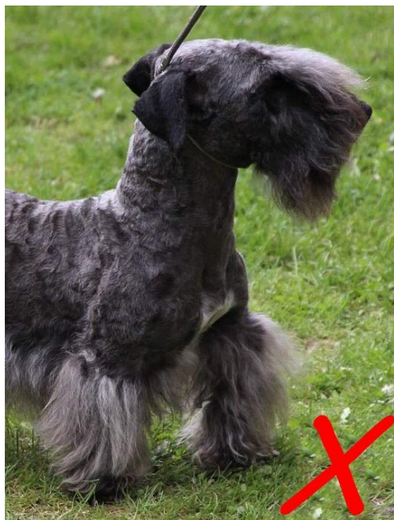
Incorrect fronts: left crooked legs, too close in pasterns, waek feet indicated by too long nails; right wide front with a short, upright upper arm and out at elbows.